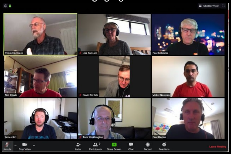
ASCILITE ML SIG video meeting